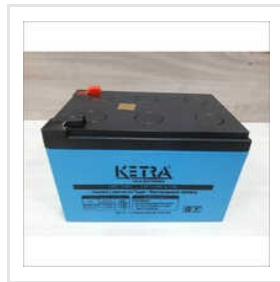
Ketra VRLA Battery