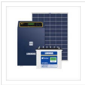
Luminous Solar Hybrid PCU Inverter