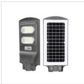
All In One Solar Street Light