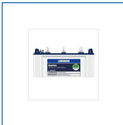
LUMINOUS INVERTER BATTERY