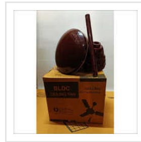
BLDC Solar Ceiling Fan