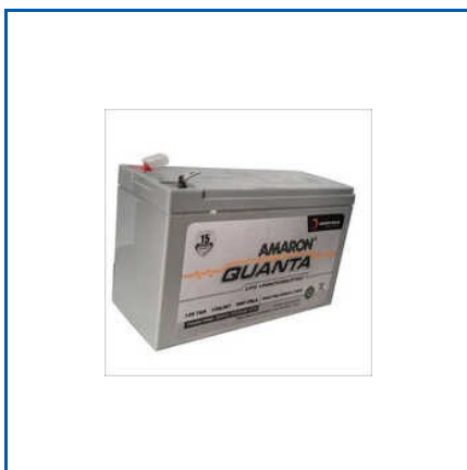
AMARON QUANTA BATTERIES

15KV Eco Solar Zatka Machine, All In One Solar Street Light, Amaron Quanta Batteries, Automatic Voltage Stabilizer, BLDC Solar Ceiling Fan, BLDC Solar Ceiling Fan With Regulator, BLDC Solar Ceiling Fan With Remote, Ketra Solar Panel, Ketra VRLA Battery, Luminous Inverter Battery, Luminous Solar Charge Controller, Luminous Solar Hybrid PCU Inverter, Luminous Solar Inverter, NXG 1625 Luminous Solar Inverter, Polycrystalline Solar Panel, etc.