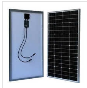
Polycrystalline Solar Panel