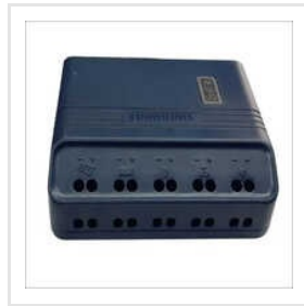
Luminous Solar Charge Controller