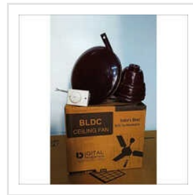
BLDC Solar Ceiling Fan With Regulator