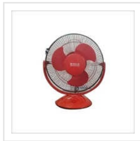
Solar DC Fan