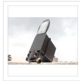
Solar Semi Integrated Street Light