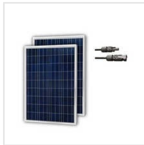
Ketra Solar Panel