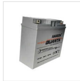
Solar SMF Battery