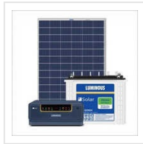
NXG 1625 Luminous Solar Inverter