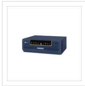
Luminous Solar Inverter