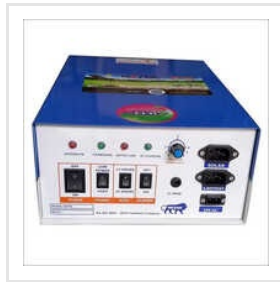
15KV Eco Solar Zatka Machine